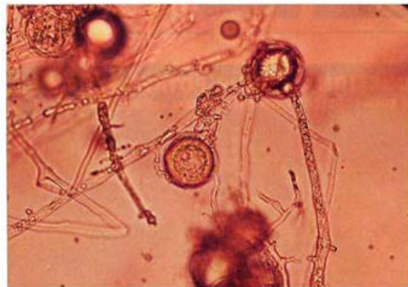
Pink Rot Oospores