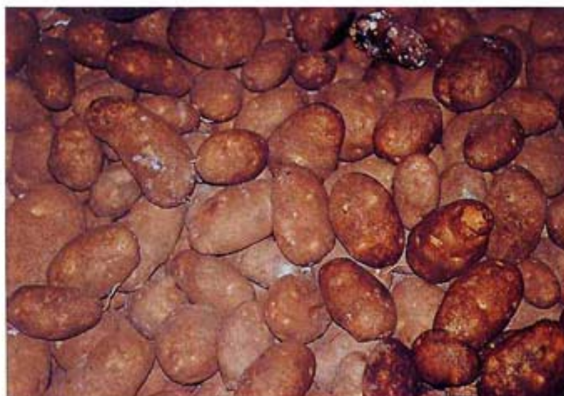
Potato Pink Rot

Fosphite at all three dilutions was effective in suppressing late blight and pink rot development when applied as a postharvest treatment in controlled studies as shown in Figure (1) and (2). Fosphite was effective when applied as low as 3.2 fl. oz. per ton tubers (1:20 dilution). No visual Phytotoxicity symptoms were seen on the Fosphite treated tubers. These results are for treatments that occurred 1 hour after inoculation. A greater delay from inoculation to treatment may provide different results.